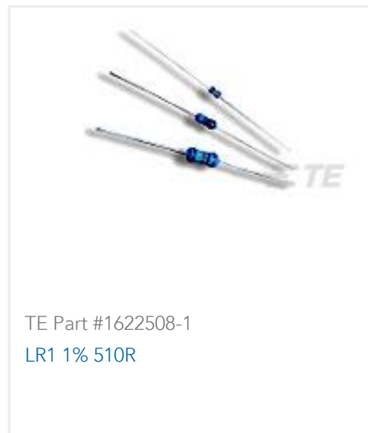
TE Part #1622508-1 LR1 1% 510R