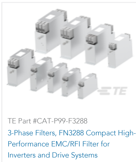
TE Part #CAT-P99-F3288 3-Phase Filters, FN3288 Compact High-Performance EMC/RFI Filter for Inverters and Drive Systems