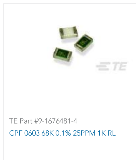
TE Part #9-1676481-4 CPF 0603 68K 0.1% 25PPM 1K RL