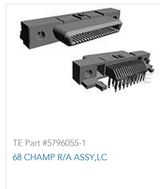
TE Part #5796055-1 68 CHAMP R/A ASSY,LC