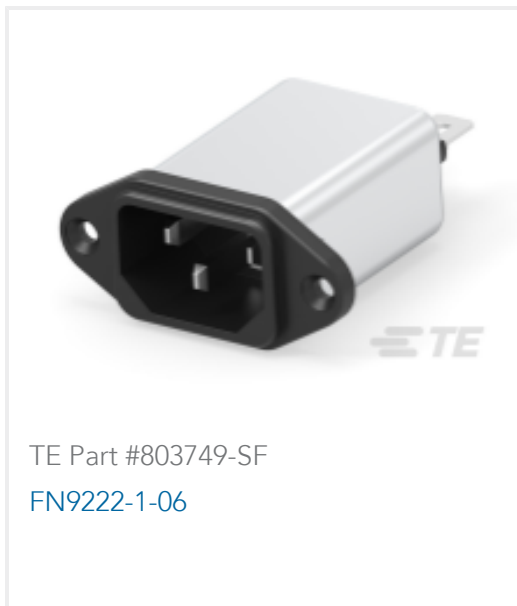
TE Part #803749-SF FN9222-1-06