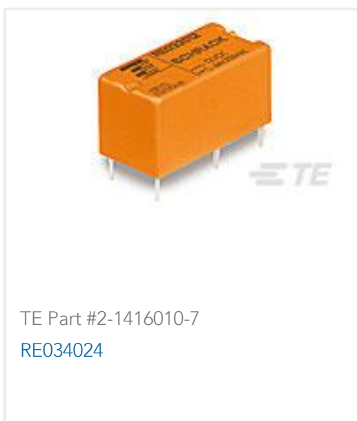
TE Part #2-1416010-7 RE034024