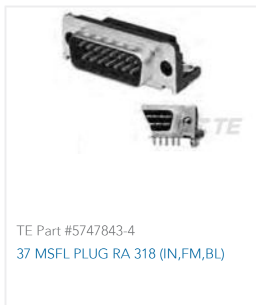
TE Part #5747843-4 37 MSFL PLUG RA 318 (IN,FM,BL)