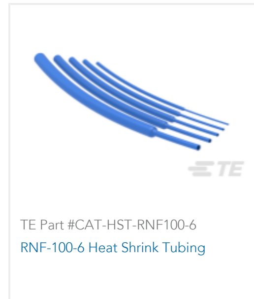
TE Part #CAT-HST-RNF100-6 RNF-100-6 Heat Shrink Tubing