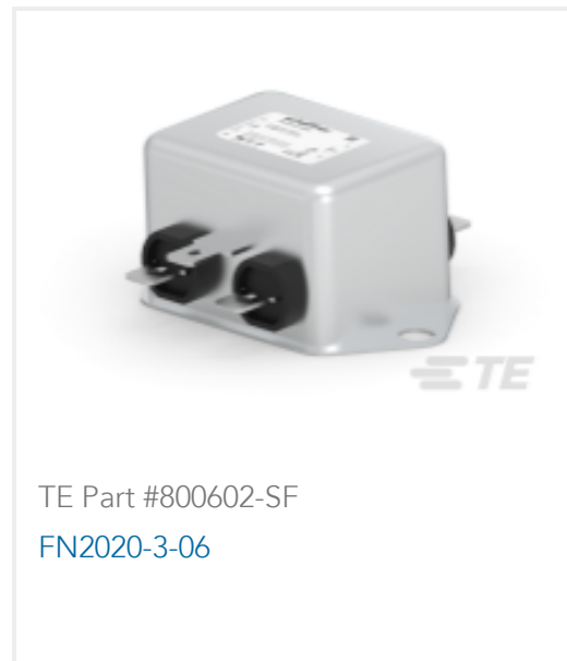
TE Part #800602-SF FN2020-3-06