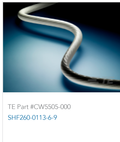
TE Part #CW5505-000 SHF260-0113-6-9