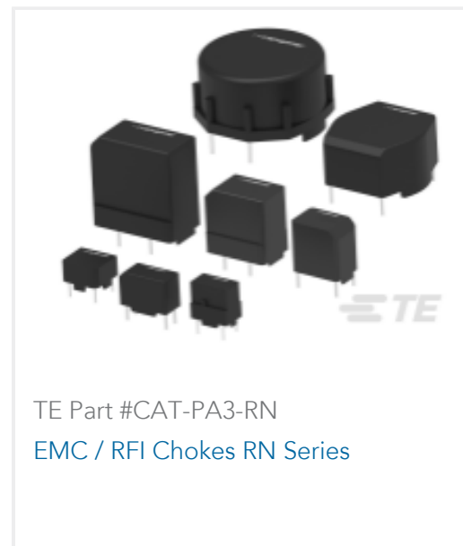
TE Part #CAT-PA3-RN EMC / RFI Chokes RN Series