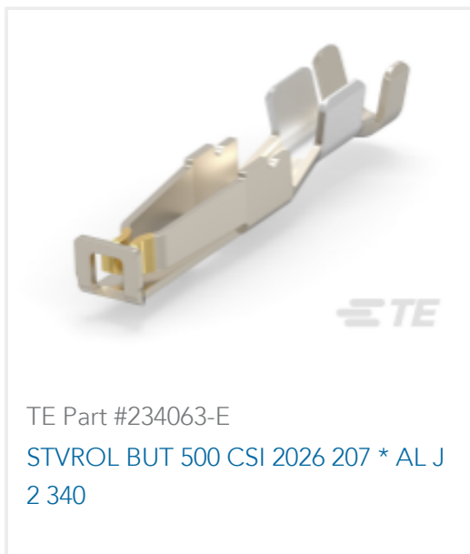
TE Part #234063-E STVROL BUT 500 CSI 2026 207 * AL J 2 340