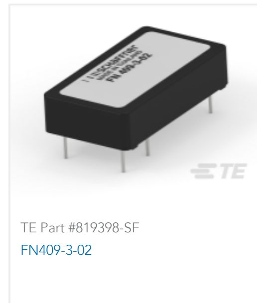
TE Part #819398-SF FN409-3-02