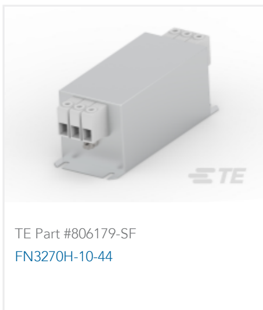
TE Part #806179-SF FN3270H-10-44