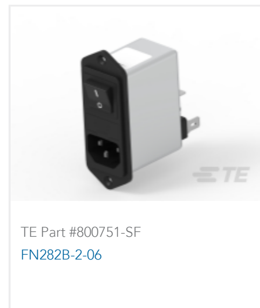
TE Part #800751-SF FN282B-2-06