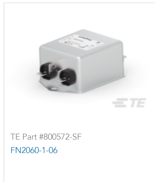
TE Part #800572-SF FN2060-1-06