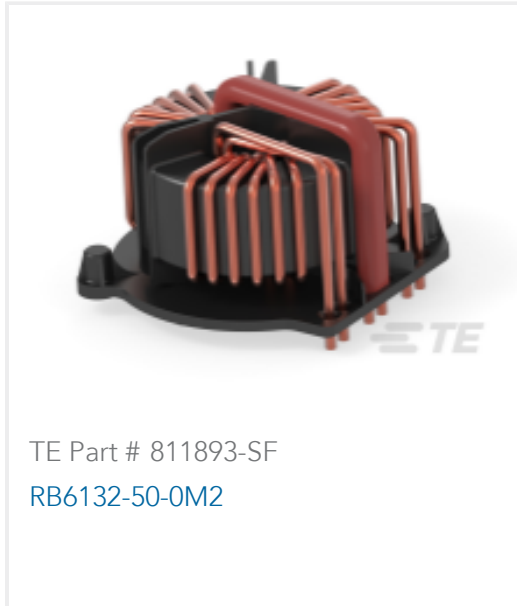
TE Part # 811893-SF RB6132-50-0M2