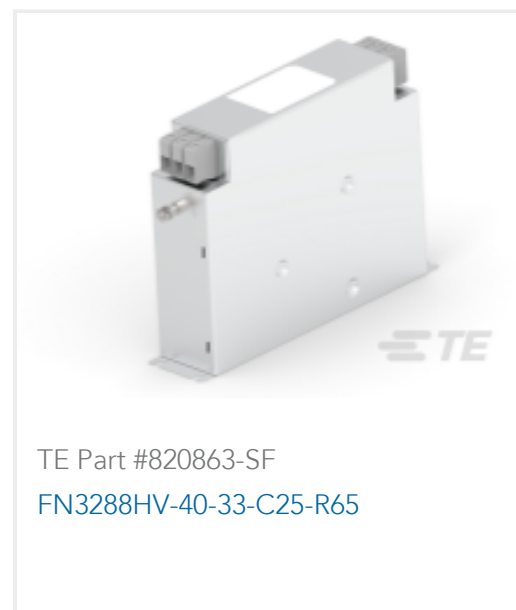
TE Part #820863-SF FN3288HV-40-33-C25-R65