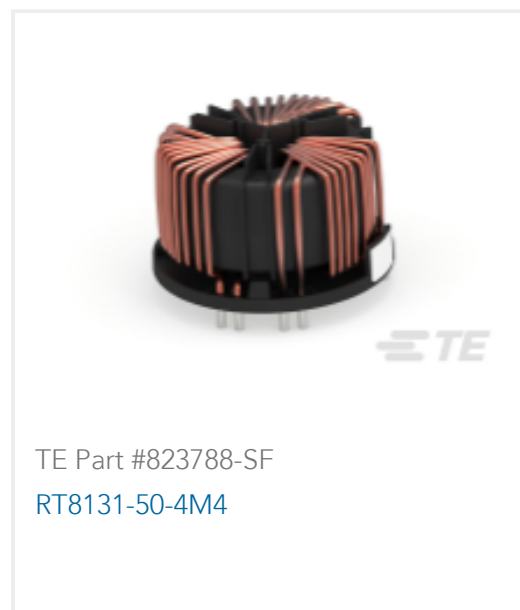
TE Part #823788-SF RT8131-50-4M4