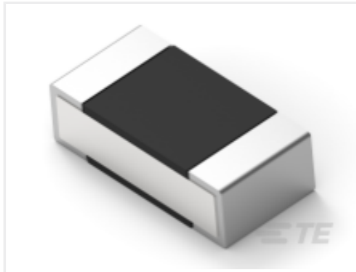
TE Part # 2-2176308-7 RP 1E 0.1W 249K 0.1% 25PPM 5K RL