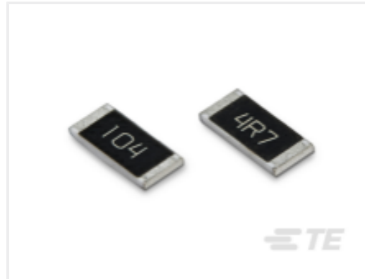
TE Part # 2176093-5 RP 2A 0.25W 10K 0.1% 25PPM 1K RL