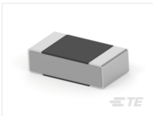
TE Part #8-1879140-5 RN 0603 140K 0.1% 10PPM 5K RL