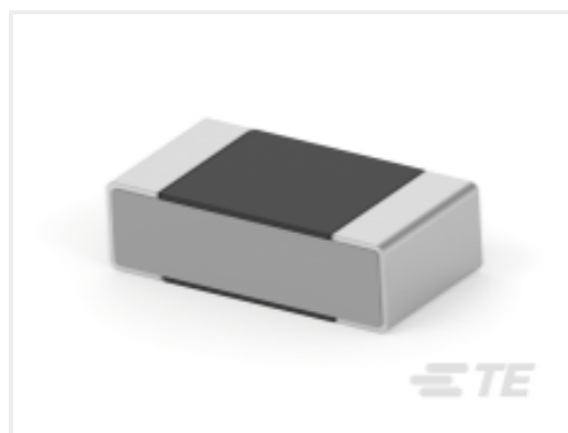
TE Part #1879207-8 RN 0603 237K 0.1% 10PPM 5K RL