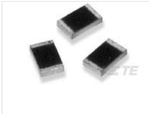
TE Part # 1625867-2 RP 1J 0.166W 10K 0.1% 25PPM 1K RL