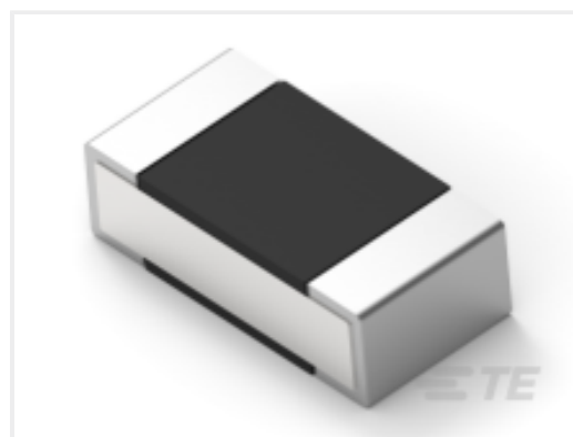
TE Part #7-2176307-7 RP 1E 0.1W 76K8 0.1% 25PPM 5K RL