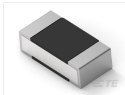
TE Part #6-2176312-8 RP 1E 0.1W 61K9 0.1% 25PPM 1K RL