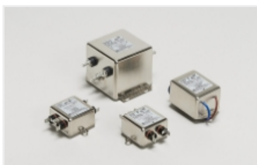
Medical Single Phase Filters(88)