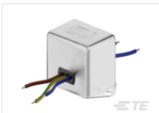
TE Part #822529-SF FN2090B-1-07