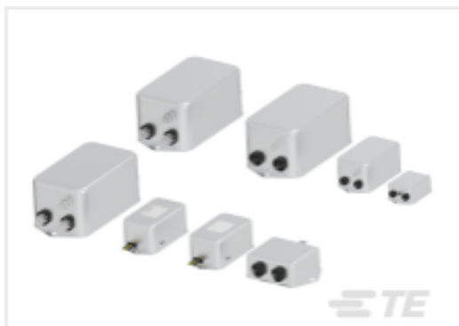
TE Part # CAT-P97-F2090 Very High Performance, FN2090, Multi stage AC/DC EMC/RFI Filter with Excellent Attenuation Performance