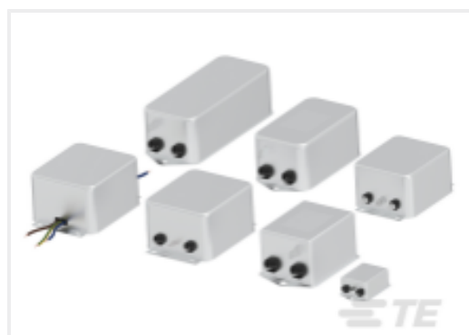
TE Part #CAT-P97-F2080 High Performance Single Phase Filters FN2080, Multi stage High Performance AC/DC EMC/RFI Filter