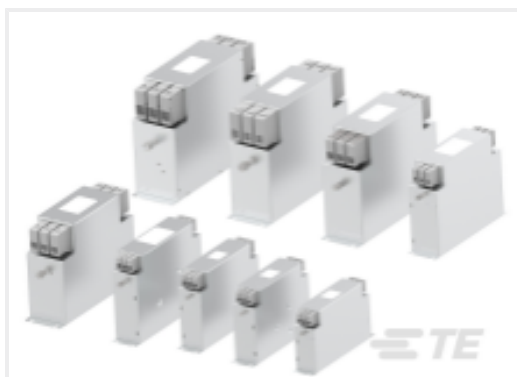
TE Part #CAT-P99-F3288 3-Phase Filters, FN3288 Compact High-Performance EMC/RFI Filter for Inverters and Drive Systems