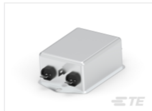
TE Part #802512-SF FN2090B-6-06