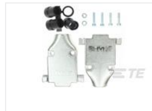
TE Part #5748676-2 DIE CAST CBL CLMP KIT,SZ 2