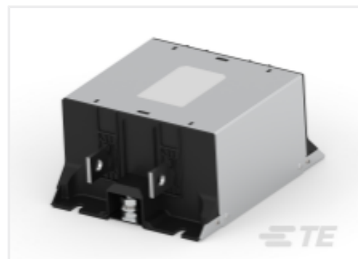
TE Part #822422-SF FN2230-300-99-C2022-R99