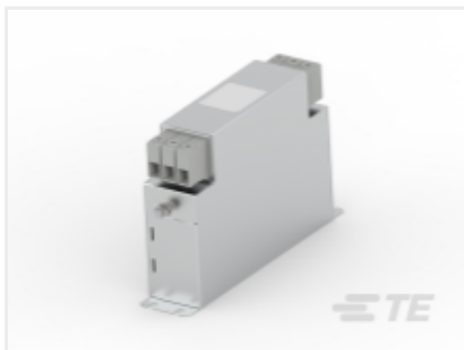
TE Part # 820844-SF FN3287-10-44-C21-R65