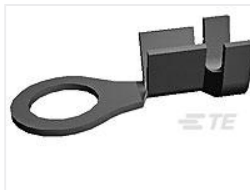
TE Part #61867-2 RING CRIMP 18-14 AWG TPBR