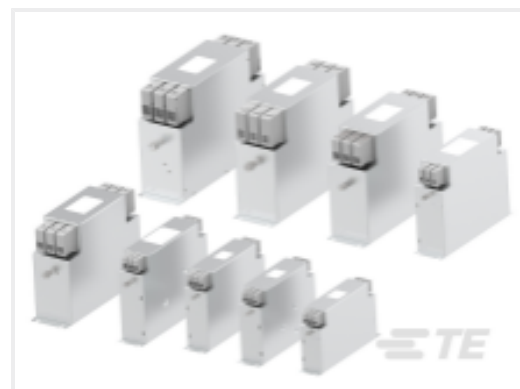
TE Part #CAT-P99-F3288 3-Phase Filters, FN3288 Compact High-Performance EMC/RFI Filter for Inverters and Drive Systems