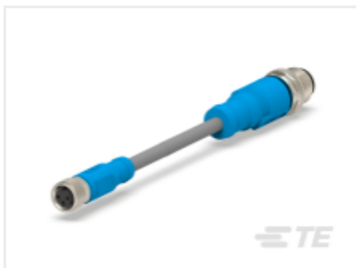
TE Part #T4052325003-002 RPC-M8-3FS-1.0-M12-3MS-PUR