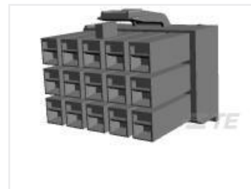
TE Part #176279-1 UNIV POWER PLUG HSG 15P F/H