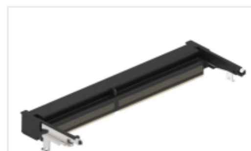
TE Part #2309411-1 DDR4 SODIMM 260P 8.0H STD