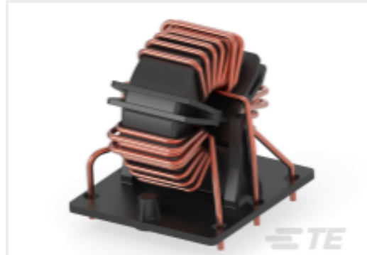
TE Part # 811897-SF RB6532-16-0M8