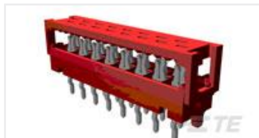
TE Part #215570-8 MICRO-MATCH PBC.08P