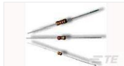
TE Part #5-1623932-7 CFR50 5% 220K