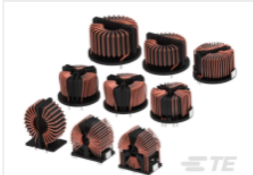
TE Part # CAT-PA3-RT EMC / RFI Chokes RT Series & RT Series N: High-Performance Chokes for Demanding Applications