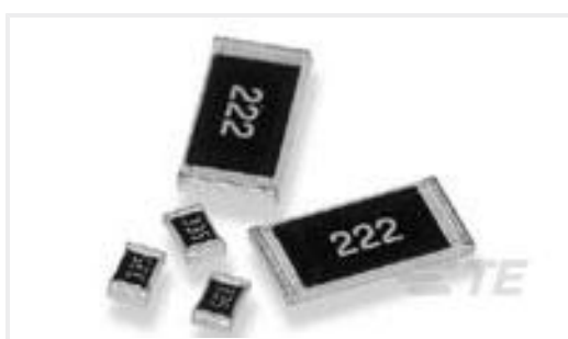
TE Part #5-1879377-2 CRGH0805 5% 120R 0.33W