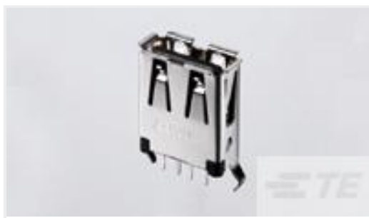
TE Part #1734366-1 Std USB Type A, VT, T/H