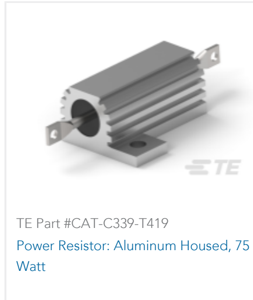
TE Part #CAT-C339-T419 Power Resistor: Aluminum Housed, 75 Watt