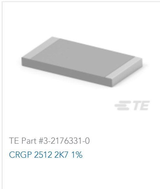
TE Part #3-2176331-0 CRGP 2512 2K7 1%