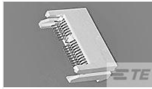
TE Part #5-1734857-5 PCI EXP STRADDLE 36P BLK 30u"