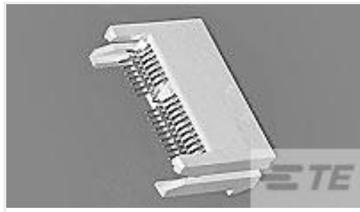
TE Part #5-1734857-1 PCI EXP STRADDLE 36P BLK 1u"