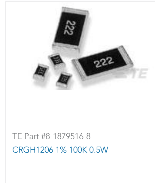
TE Part #8-1879516-8 CRGH1206 1% 100K 0.5W