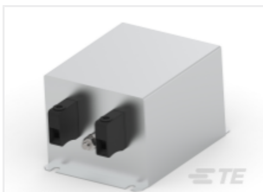
TE Part #806189-SF FN2412-32-33