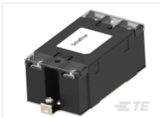
TE Part # CAT-P97-F2450 Standard Performance Single Phase Filters FN2450, Safe and Ergonomic EMC/RFI Filter with Very Low Leakage Current