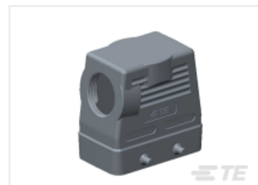
TE Part #T1230100132-000 H10B-TSH-M32