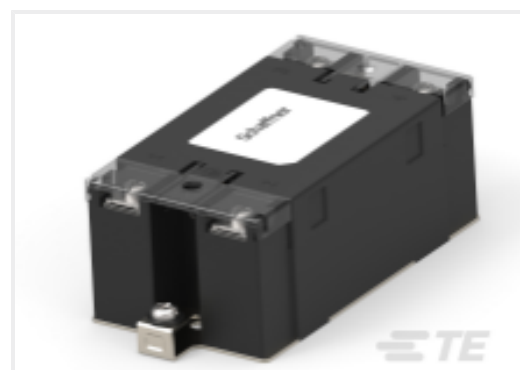
TE Part #810012-SF FN2450G-6-61