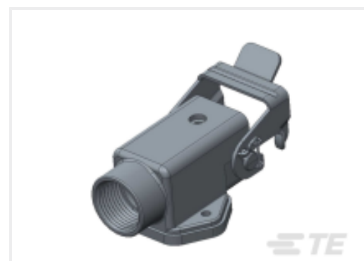
TE Part #T1619030120-000 H3A-MAGSV-M20