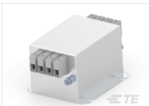
TE Part #806120-SF FN3256H-36-33