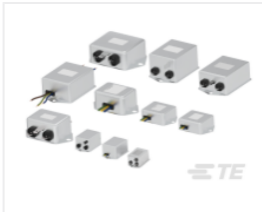
TE Part # CAT-P97-F2030 High Performance Single Phase Filters FN2030, General Purpose AC/DC EMC /RFI Filter with High Attenuation Performance