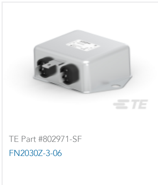
TE Part #802971-SF FN2030Z-3-06