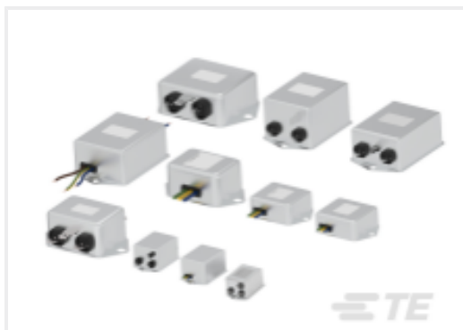
TE Part # CAT-P97-F2030 High Performance Single Phase Filters FN2030, General Purpose AC/DC EMC /RFI Filter with High Attenuation Performance