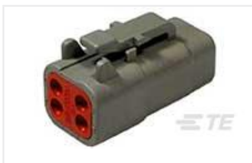
TE Part #DTM06-4S PLG, 4P, GRY, N