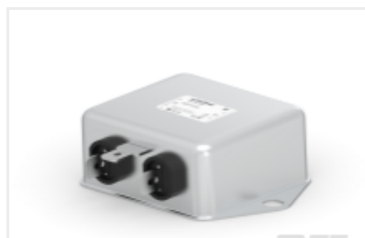
TE Part #803990-SF FN2030BZ-4-06