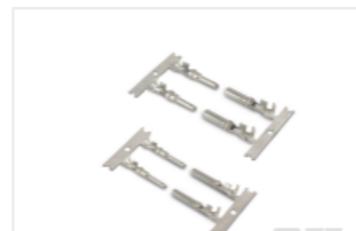
TE Part #CAT-D48-SFT273 DEUTSCH Connector Stamped and Formed Contacts - Reel