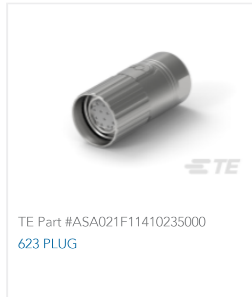
TE Part #ASA021F11410235000 623 PLUG