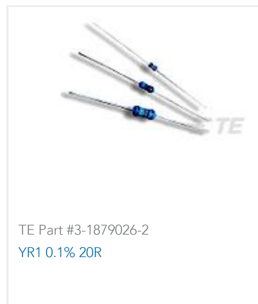
TE Part #3-1879026-2 YR1 0.1% 20R