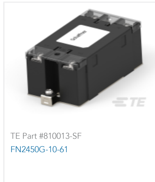
TE Part #810013-SF FN2450G-10-61