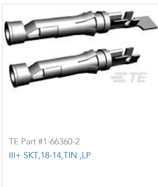
TE Part #1-66360-2 III+ SKT,18-14,TIN ,LP