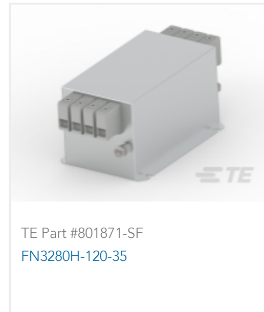
TE Part #801871-SF FN3280H-120-35