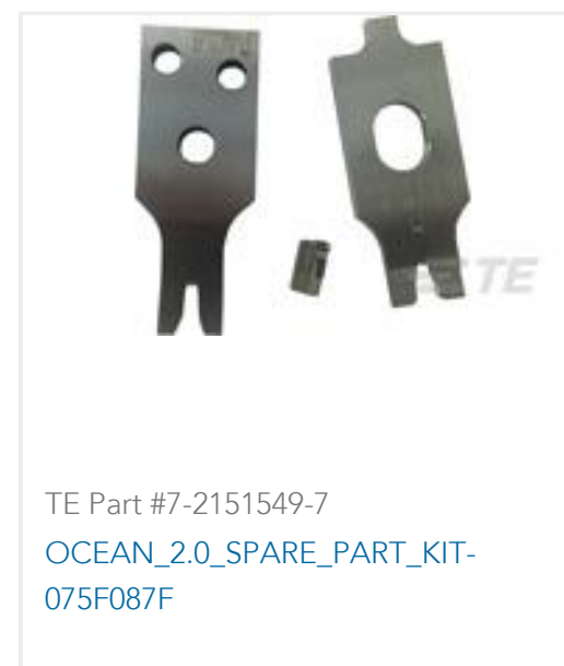
TE Part #7-2151549-7 OCEAN_2.0_SPARE_PART_KIT-075F087F