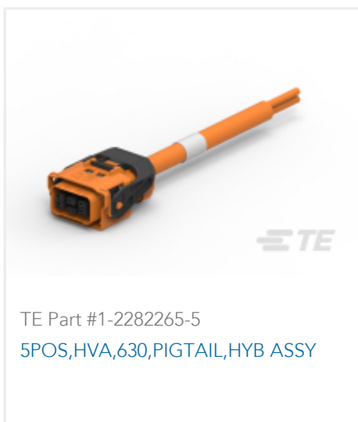
TE Part #1-2282265-5 5POS,HVA,630,PIGTAIL,HYB ASSY