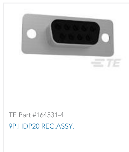
TE Part #164531-4 9P.HDP20 REC.ASSY.