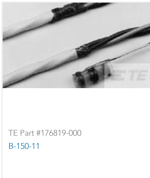
TE Part #176819-000 B-150-11