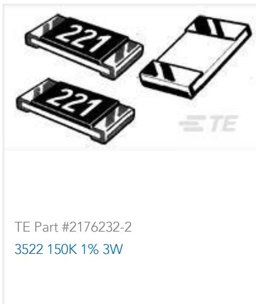
TE Part #2176232-2 3522 150K 1% 3W