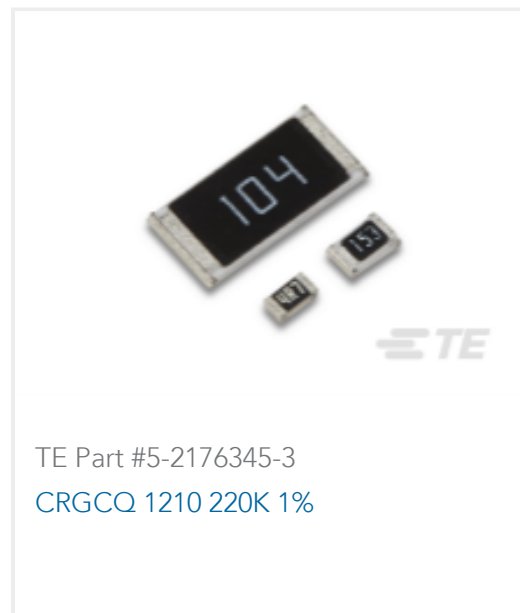
TE Part #5-2176345-3 CRGCQ 1210 220K 1%