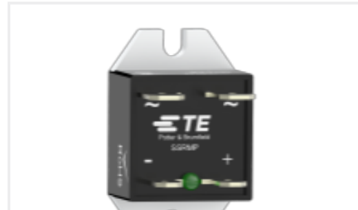
TE Part #2323802-9 SSRMP-240D10R = Mini Puck,10A, 240V AC,R