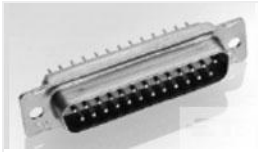
TE Part #1757820-4 AMPLIMITE,ASY,RCPT,STD,109,ZN,4