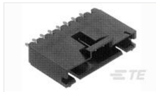
TE Part #103908-2 03 MTE HDR SRST LATCH W/HLDWN