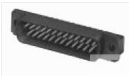
TE Part #5745073-2 HD-20 PLUG 25P VERT FFSCRLK