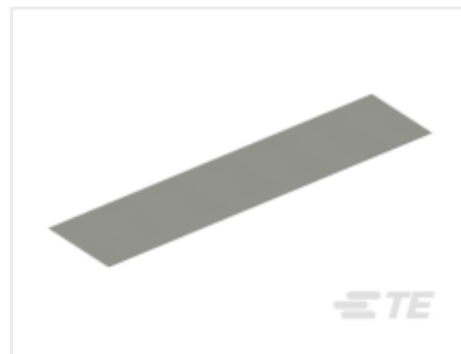
TE Part # CAT-EMIG-0004 Oriented Wire EMI Gasket