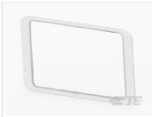
TE Part # 2509147-1 GASKET IN SILICONE SPONGE AND SS MESH