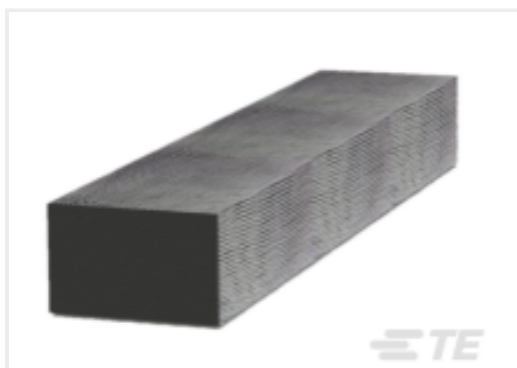
TE Part #2423878-1 Rect Sil Sponge Core Mon 4.8x12.7 L25m