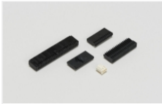
Wire-to-Board Connector Assemblies & Housings(25)