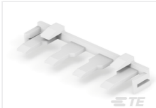
TE Part # 2364004-4 STANDARD TIMER TPA 4P, 10mm