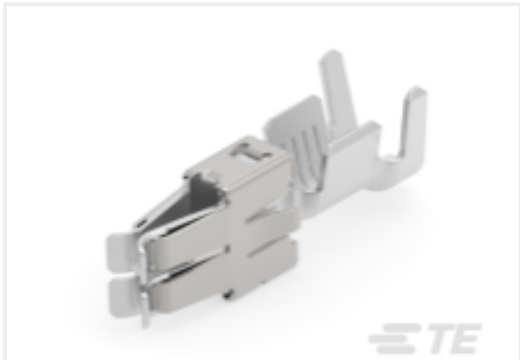
TE Part # 2488877-1 STD PW TIMER CONTACT