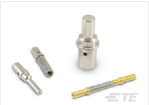
TE Part #CAT-D48-ST273 DEUTSCH Connector Solid Contacts