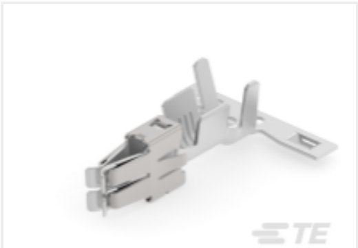
TE Part # 2364003-1 STD PW TIMER CONTACT