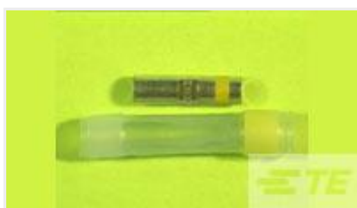
TE Part #650075-000 D-436-37