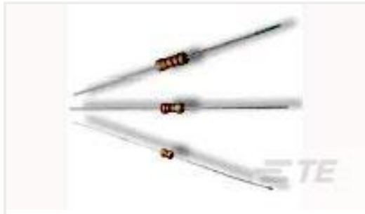
TE Part # 1623932-8 CFR50 5% 10K