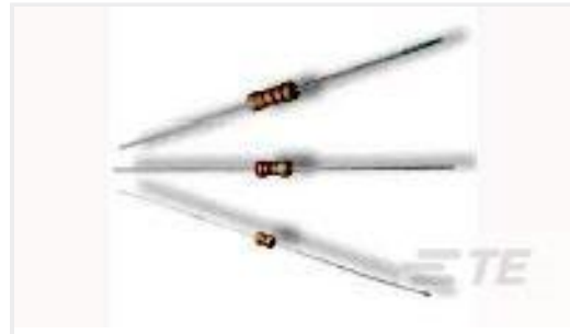
TE Part # 1623927-8 CFR16 5% 120R