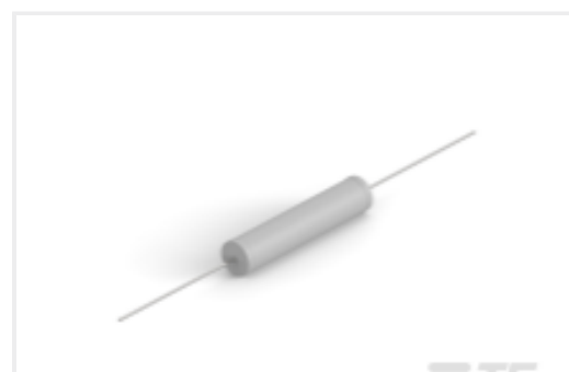
TE Part #3-2176415-7 8W STD M/OX 5% 910R