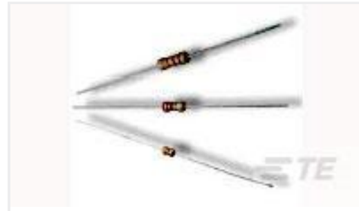
TE Part # 1623930-3 CFR25 5% 10K