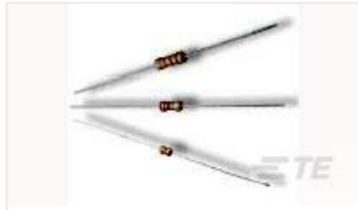
TE Part # 2-1623929-2 CFR200 5% 22K