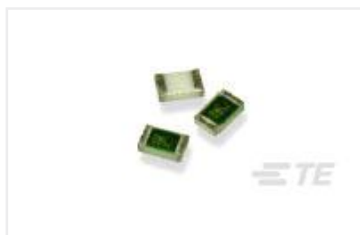
TE Part #5-1879335-8 CPF 0603 84R5 1% 50PPM 1K RL