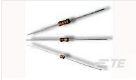
TE Part # 1623925-2 CFR100 5% 100R