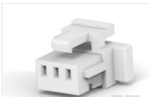
TE Part #2-2367198-3 1.0 WTB HOUSING WITH LATCH