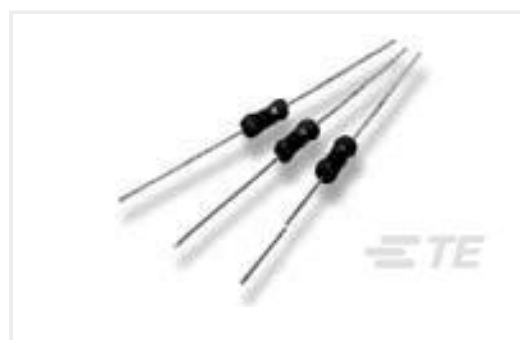
TE Part #5-1879351-9 RR01 5% 750K AMMO