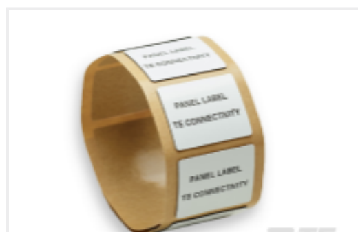
TE Part #2322686-1 PL-027013-1.5-9