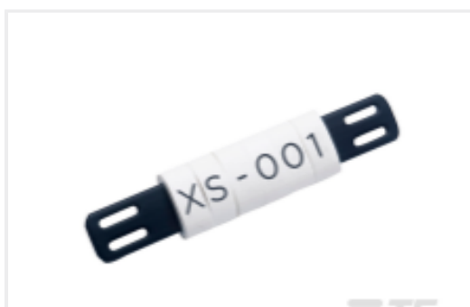
TE Part #EC6559-000 13611940