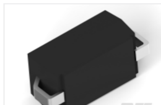
TE Part #2-2176324-2 SMV 3W 5M6 5%