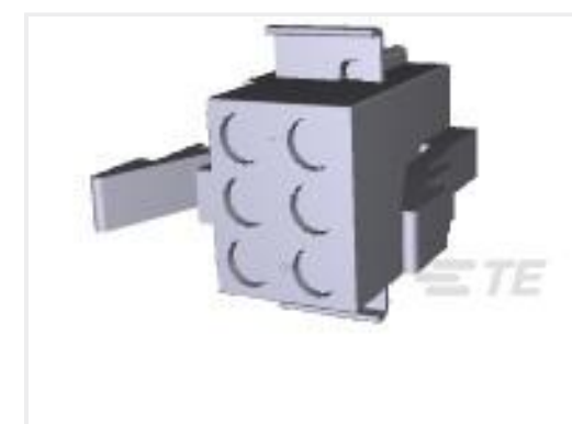
TE Part #1-480273-0 06P CMNL PLUG HSG P/M NATL