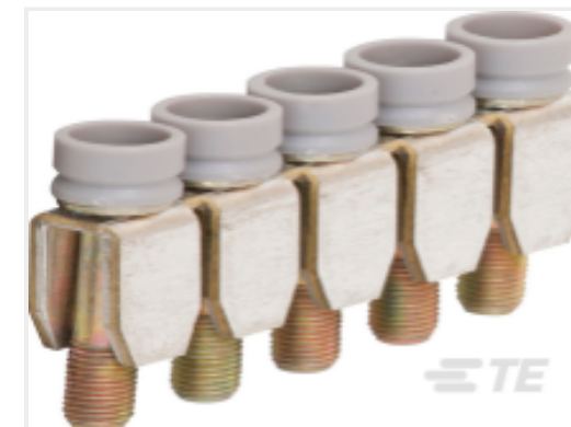
TE Part #1SNA176673R0200 BJMI8-10