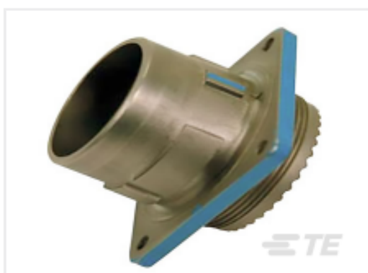
TE Part #YDIV46E17-35PNV001 PLUG ASSY