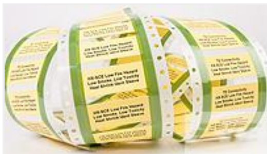
TE Part #F77737-000 HX-SCE-1K-4.8-50-9