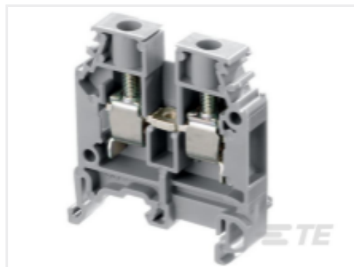
TE Part #1SNA105004R2200 M6/8