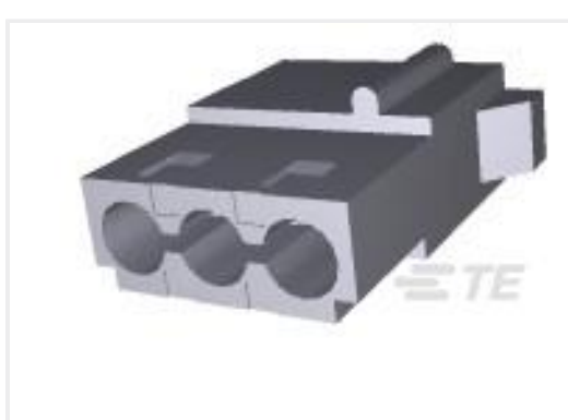
TE Part #1-480303-0 03P CMNL PLUG HSG F/H NATL