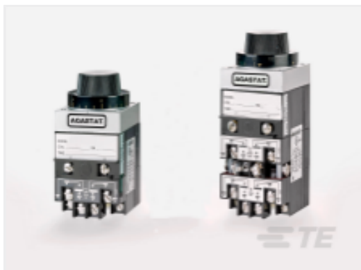
TE Part # 2-1423159-6 7012PD=RLY,STD,ON,2P,125VDC,50