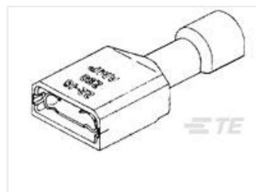
TE Part #3-350819-2 ULTRA-FAST 250 ASY REC 16-14 AWG TPBR