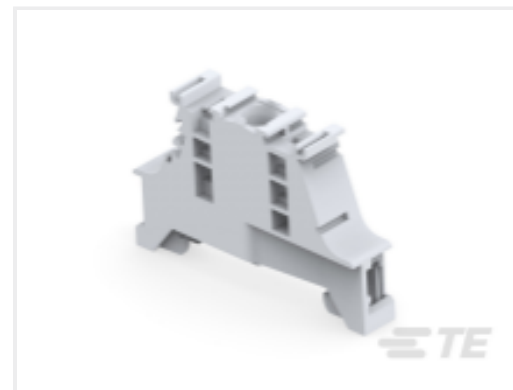
TE Part #1SNK900001R0000 BAM4