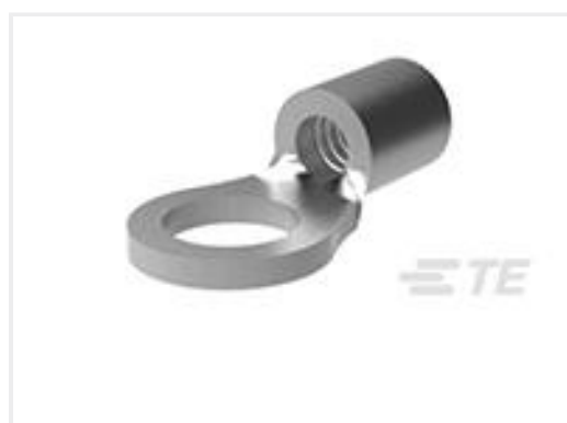
TE Part #2-34107-2 SOLIS R 22-16 COMM 22-18 MIL 6