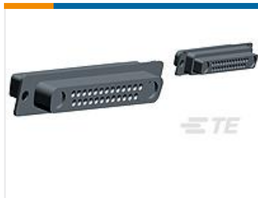
TE Part # 212542-1 RECEPT ASSY,27C2,AMPLIMITE