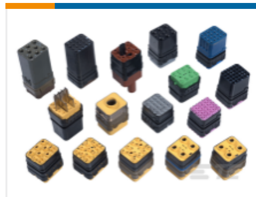
TE Part # ZPF000000000206305 DMC-M 22-10 PC