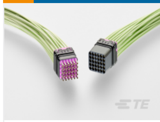
TE Part # ZPF000000000202892 DMC-MR 30-23 BC