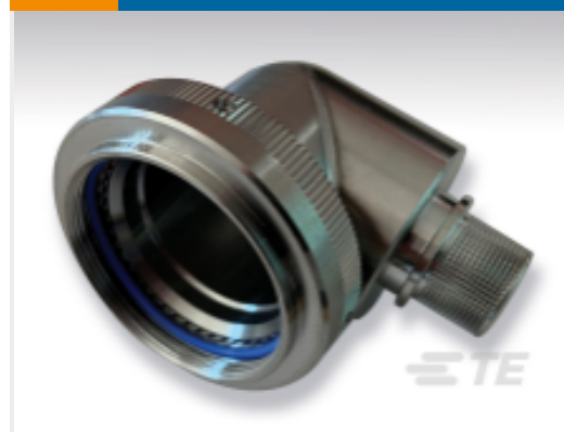
TE Part # EJ3296-000 EN3660-062F13C