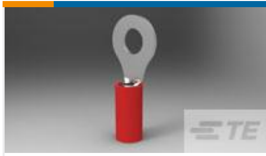
TE Part #320571 PIDG R 22-16 COMM 22-18MIL 1/4