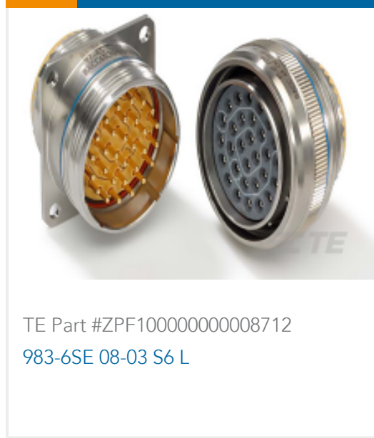
TE Part #ZPF100000000008712 983-6SE 08-03 S6 L