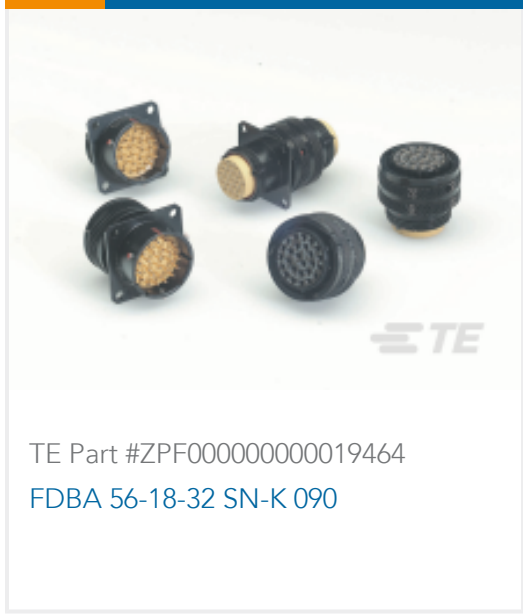
TE Part #ZPF000000000019464 FDBA 56-18-32 SN-K 090