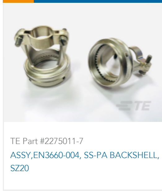
TE Part #2275011-7 ASSY,EN3660-004, SS-PA BACKSHELL, SZ20