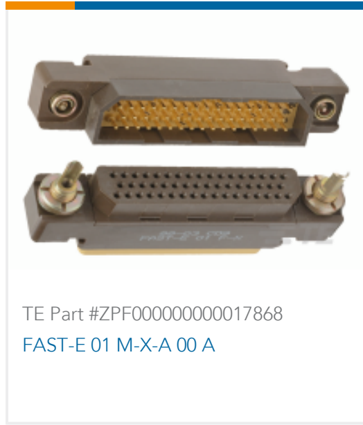
TE Part #ZPF000000000017868 FAST-E 01 M-X-A 00 A