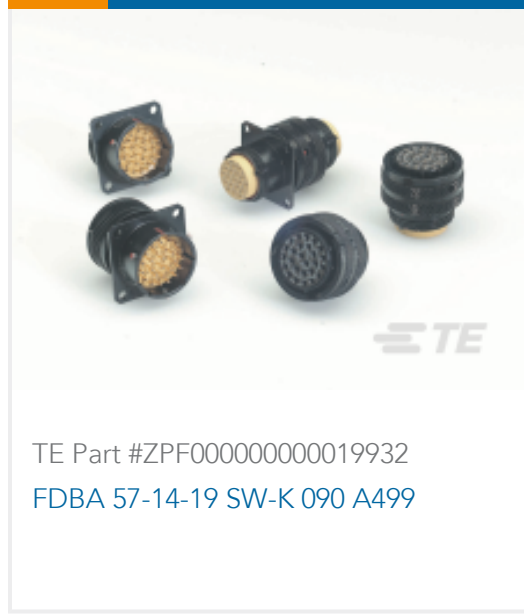
TE Part #ZPF000000000019932 FDBA 57-14-19 SW-K 090 A499