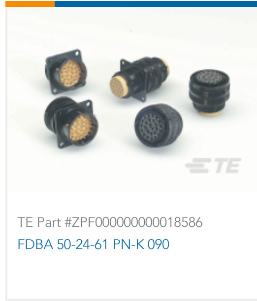
TE Part #ZPF000000000018586 FDBA 50-24-61 PN-K 090