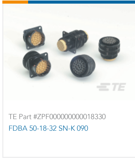
TE Part #ZPF000000000018330 FDBA 50-18-32 SN-K 090