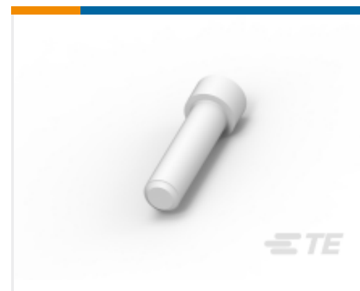
TE Part # 114017-ZZ SEALING PLUG, SIZE 12/16, WHT