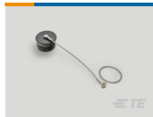
TE Part # YDTS32F19NV0010000 DUST COVER ASSEM