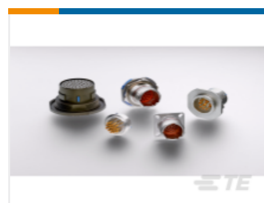
TE Part # YDTS23H19-35DNV001 HERM RECP