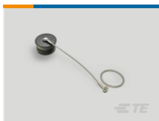
TE Part # YDTS32T19NV0010000 CAP ASSEMBLY