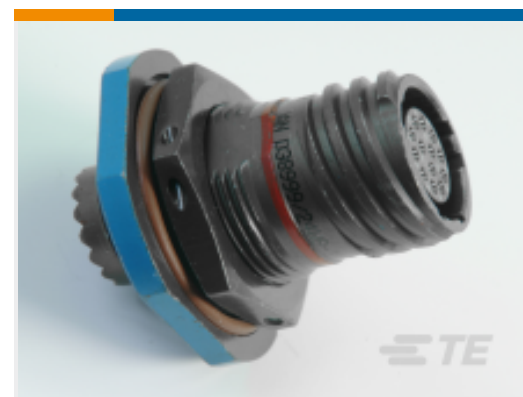
TE Part # CAT-D38999-DTS10M D38999: Jam Nut, 19-35 Insert, Electroless Nickel Plating