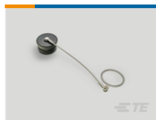
TE Part # YDTS32W19NV0010000 DUST COVER ASSEM