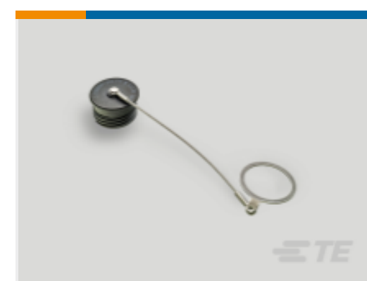
TE Part # YDTS32W19RV0010000 DUST COVER ASSEM