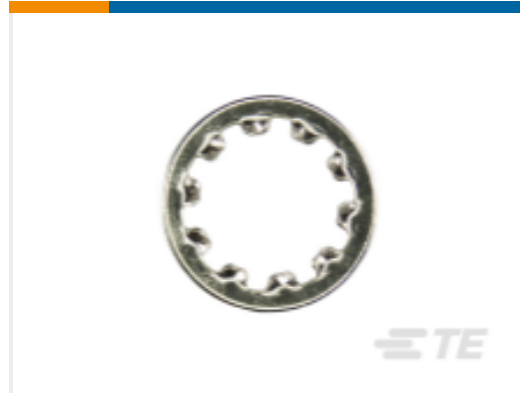
TE Part #WS-SMA-N Washer Nickel SMA Connector RoHS