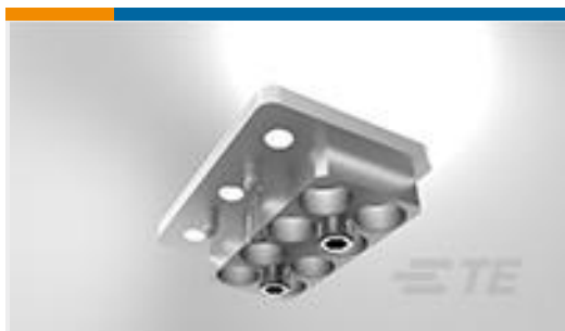
TE Part #2157553-1 RF BACKPLANE MODULE 8 POS