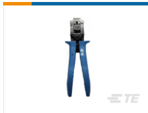
TE Part #2255142-1 MINI SAHT D1000-2L