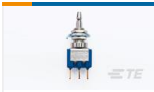
TE Part #1977737-2 MPS1004F PSHBTN 0.4VA SPDT MMN