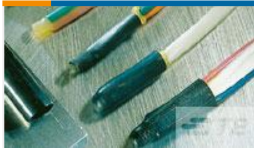
TE Part #EG41050001 ES-CAP-NO.2-B9-0-35MM