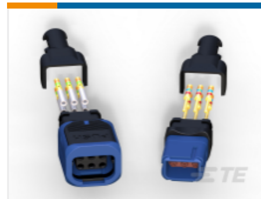
TE Part #YD369-P33-CS000000 369 3 WAY PLUG, NO CONTACTS, SKT