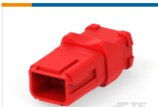
TE Part #YD369-R66-AP000000 Rectangular Connectors, 6 Way Receptacle