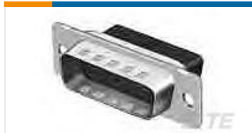
TE Part #205204-9 CRIMP SNAP PLUG ASSY,SIZE 1