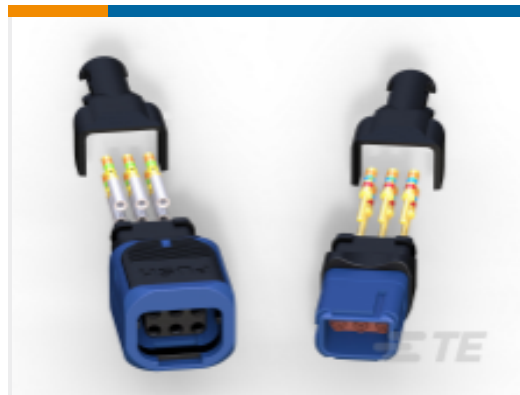
TE Part #YD369-P99-AS000000 369 9 WAY PLUG, NO CONTACTS, SKT