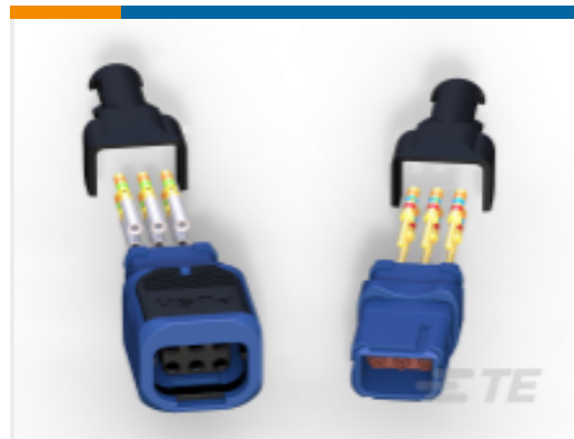
TE Part #YD369-HR33-CP30000 369 HARSH 3 WAY REC, 20/22 AWG, PIN