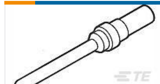
TE Part #205089-1 HD 20 PIN CONTACT