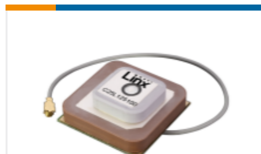
TE Part #L9000173-01 Antenna GNSS L1L2L5 25x25 LNA 1.13 UFL