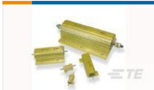
TE Part #2-1630027-7 HSC300 8R0 5%