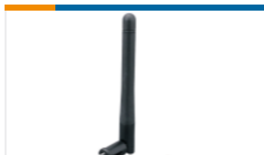
TE Part #ANT-DB1-LPD-125 Antenna Dipole Swivel 2.4/5.8GHz UFL