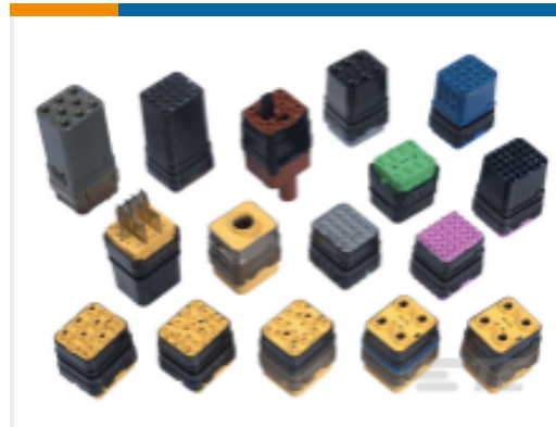
TE Part #ZPF000000000148762 DMC-M 99-04 AN (=33537-P0000)