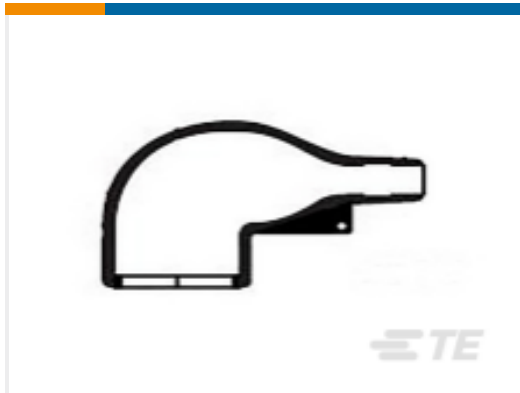
TE Part #EF9981-000 222K121-25L/225-0