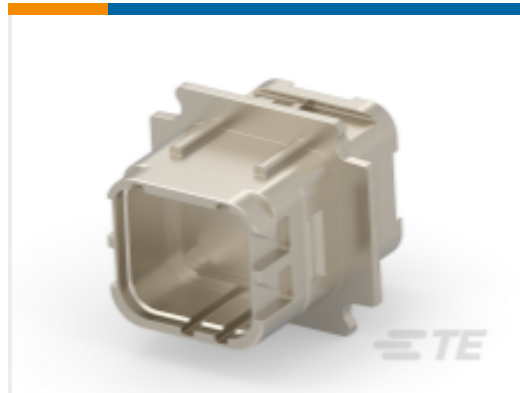
TE Part #ZPF000000000146309 Rectangular Connector Receptacle Extenders, Tool-less Assembly