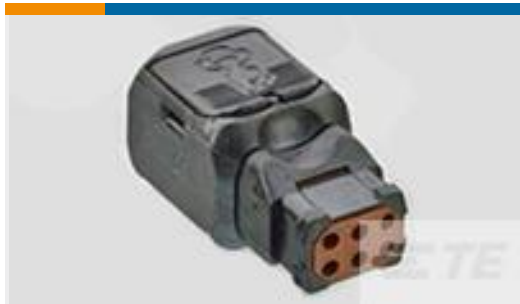
TE Part #D369-P66-NS0 369 6 WAY PLUG, NO CONTACTS, SKT