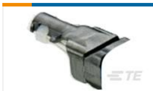
TE Part #D369-STB-3 369 3 WAY BACKSHELL STRAIGHT TIE WRAP