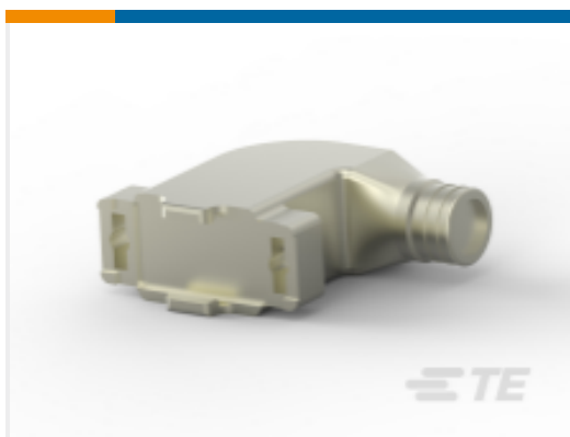
TE Part #134752-3 KIT CAPOT HD-20 9P