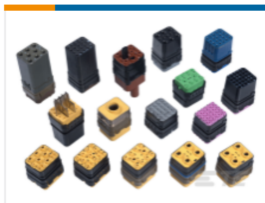
TE Part #ZPF000000000099705 DMC-M 99-01 BN