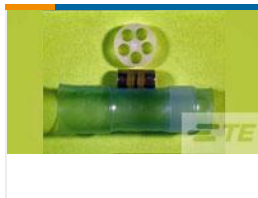
TE Part #650139-000 D-436-52