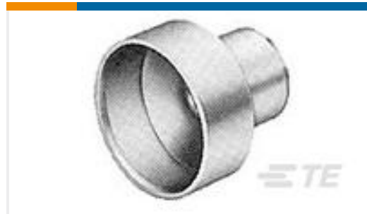
TE Part #3-747579-4 SHLDNG FERRULE, PLTD, BULK PKG