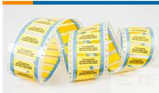
TE Part #5061850001 TMS-SCE-1/2-2.0-9