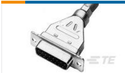
TE Part #1658649-1 KIT, HDP-20, OVRMLD, RCPT, SIZE 3,