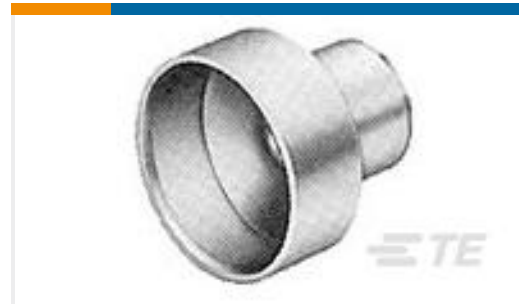
TE Part #3-747579-2 SHLDNG FERRULE, PLTD, BULK PKG