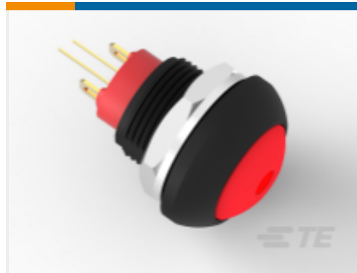
TE Part #2329387-7 PB OFF/ON FC RED M1 TERM RED LED IP68