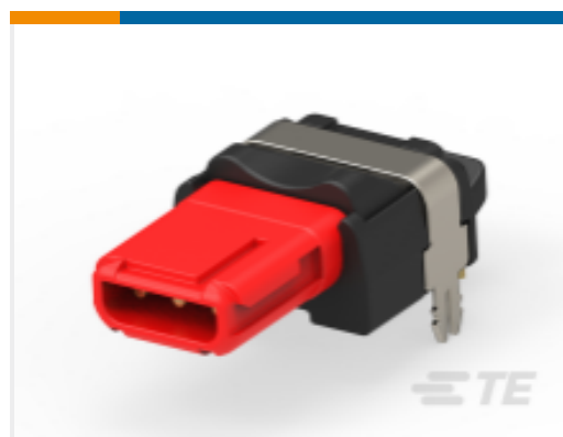
TE Part # CAT-D369-G33 PCB Mount Receptacle: 3-Way Inline