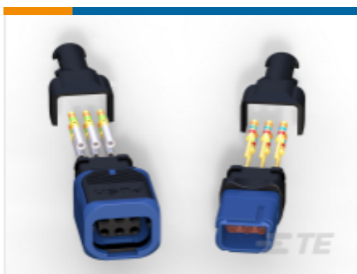
TE Part # YD369-R33-AP000000 369 3 WAY REC, NO CONTACTS, PIN