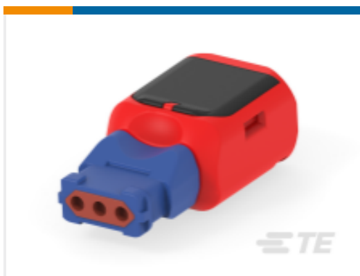
TE Part #D369-P33-AP0 Rectangular Connectors: 3-Way Plug