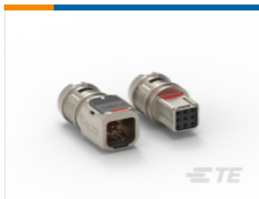
TE Part #YD369-MP99-NP10000 369 9 WAY SHIELDED PLUG, CRIMP, PIN