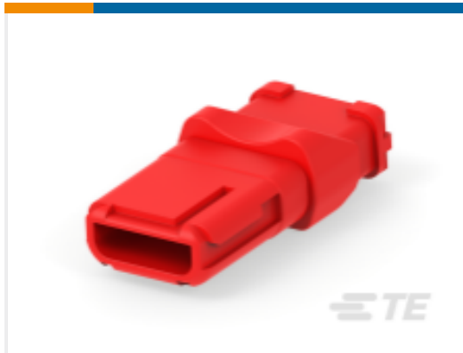
TE Part #D369-R33-NP1 Rectangular Connectors, 3 Way Receptacle