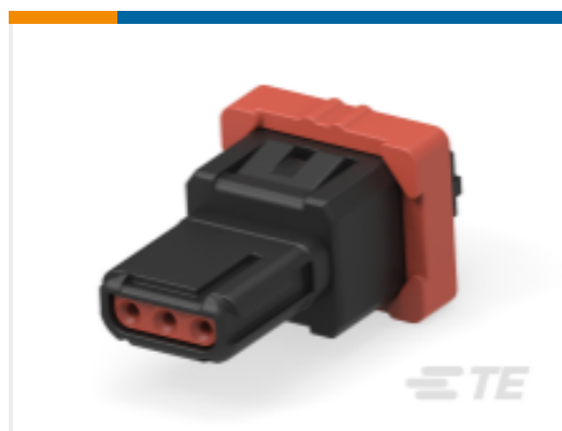
TE Part # CAT-D369-B33 Rectangular Connectors: 3-Way Panel Mount, 90PCB