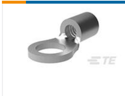
TE Part #8-33458-2 TERM,SOLIS R 12-10 1/4