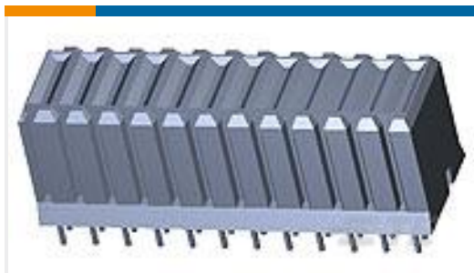
TE Part #5223995-2 UPM EXPANDED RECEPTACLE ASSEMB