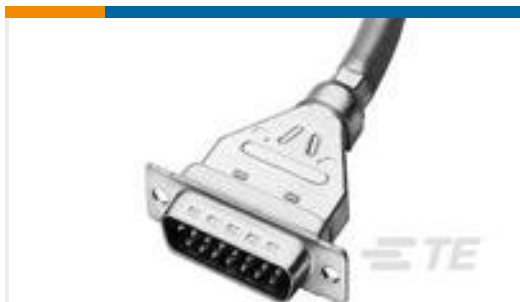
TE Part #1658652-1 KIT,HDP-20,OVRMLD,PLUG,SIZE 5,