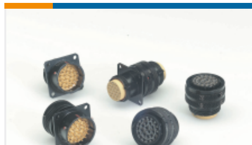
TE Part #ZPF00000000019008 FDPA 54-20-41 SN-K-B5801