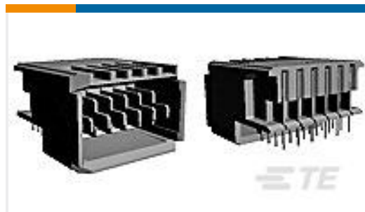
TE Part #5646955-1 UPM EXPANDED PIN ASSEMBLY