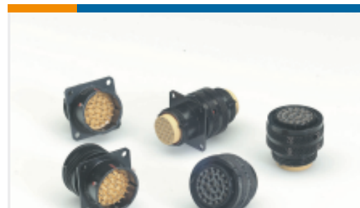
TE Part #ZPF00000000019304 FDPA 56-14-19 SN-K 059