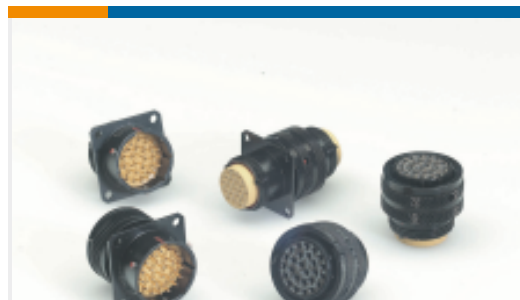
TE Part #ZPF00000000018908 FDPA 54-14-19 PN-K-A499