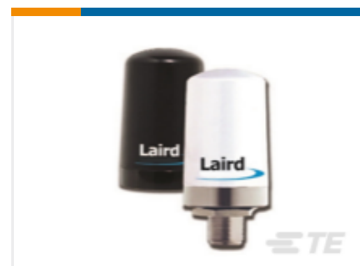
TE Part #TRA9023NP OMNI,SB,Ph,902-928MHZ 3,NP PMT