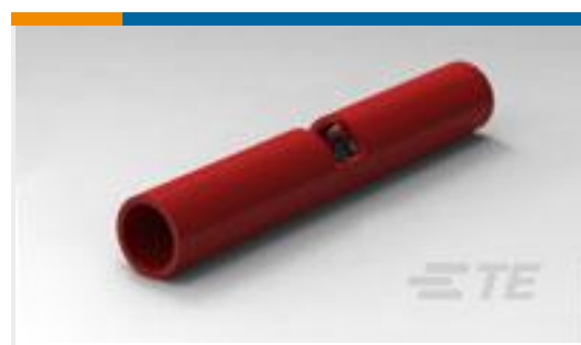
TE Part #320559 PIDG SPLICE 22-16COMM 22-18MIL