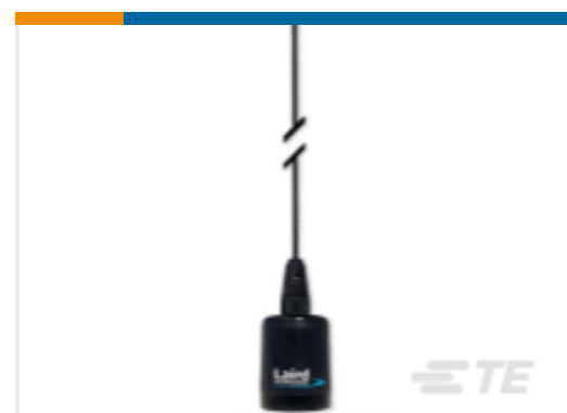
TE Part #BB4302N WHIP,MC,1/2,430-450MHZ TUN,2.4, BK,NGP,