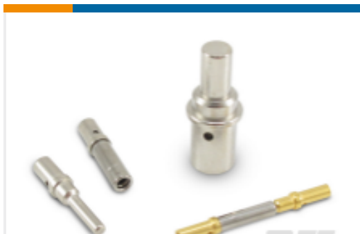
TE Part #0462-201-16141 DEUTSCH Solid Contacts