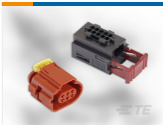
TE Part #1-964449-1 Timer Connector Housing