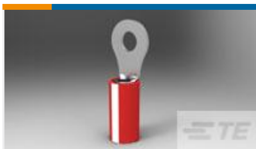
TE Part #51863-7 TERMINAL, PIDG R IR 18 6