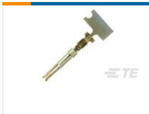
TE Part #745253-3 20 DF SOCKET PLTD