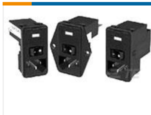
TE Part #3-6609106-0 PS0S0DHXB=C1178