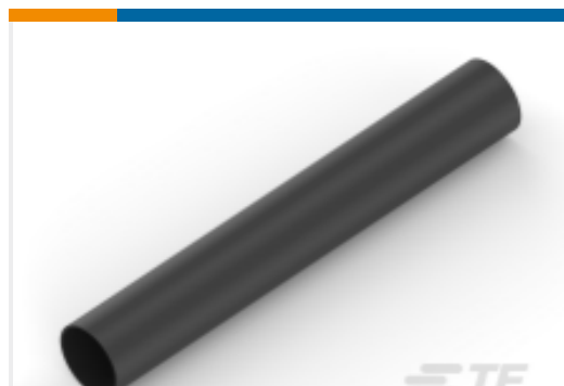
TE Part #EM7493-000 SWFR-X2 Heat Shrink Tubing