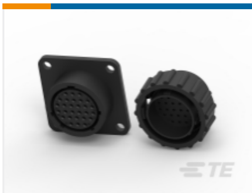
TE Part #206433-3 CPC Connectors, Series 2