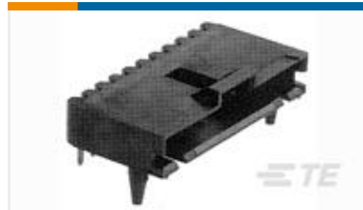
TE Part #5-104361-4 05 MTE HDR SRRA LATCH W/HLDWN