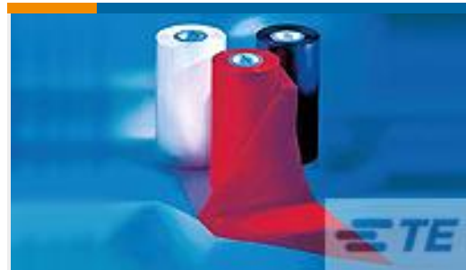
TE Part #754073-000 TMS-RJS-RIBBON-4HT