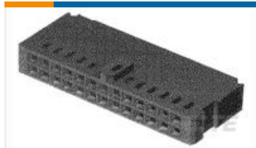
TE Part #102387-4 20 MODIV HSG COMP DR .100 POL