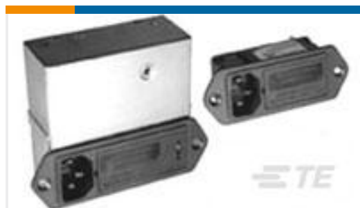
TE Part #1-6609132-0 3EZM4S=F8124