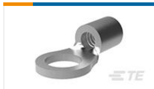
TE Part #34110 SOLIS R 22-16 COMM 22-18 MIL 6