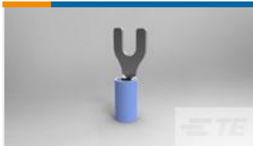
TE Part #321233 TERMINAL,PIDG SPD 16-14 8