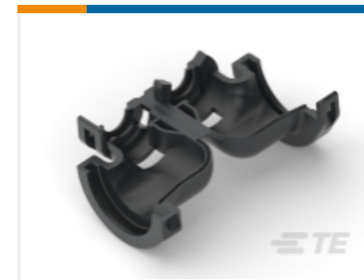
TE Part #1-1801468-1 COVER, ROTATIVE, 3 WAY HP CONNECTOR