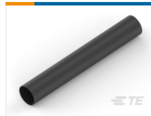
TE Part #EM7493-000 SWFR-X2 Heat Shrink Tubing