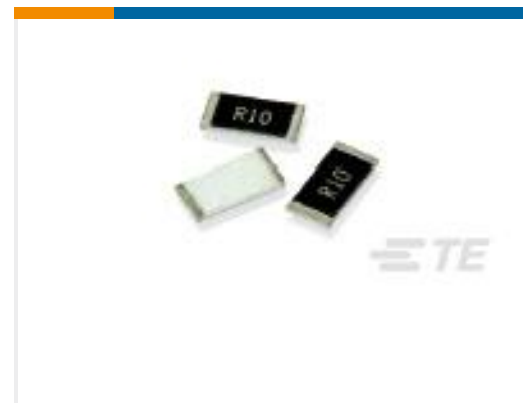
TE Part #1-2176055-8 RLP73N 2B R051 1% 1K RL