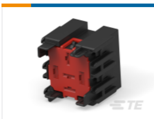
TE Part #2295764-1 MINIRELAY HOLDER ASSEMBLY