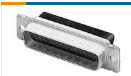
TE Part #1658672-1 HDP-22,PLUG,SIZE 3,44 POSN