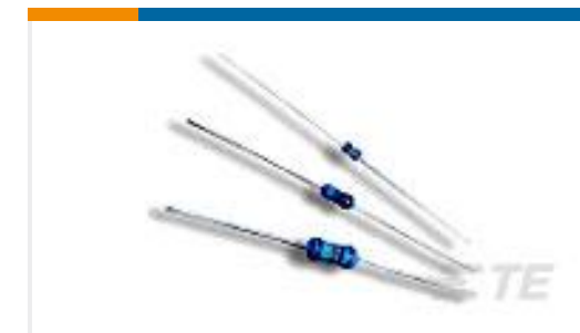
TE Part #1622296-1 LR1 1% 100K