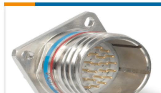
TE Part #YDTS20W15-97SAV001 RECP ASSY