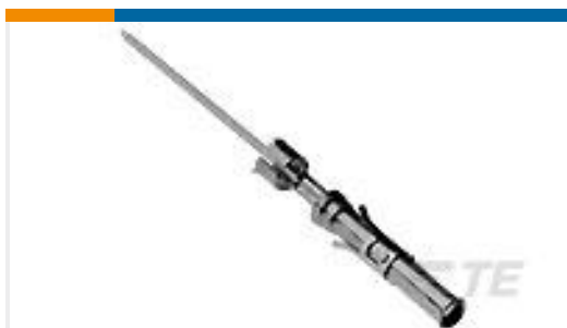
TE Part #6-66461-2 SKT,.062 DIA,.025 SQ POST,LP