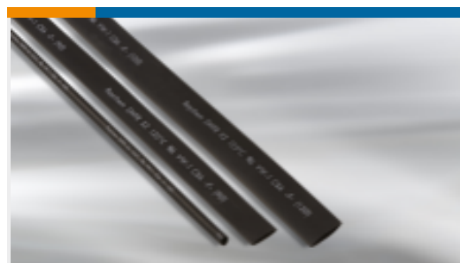
TE Part #EM7548-000 X4-12.0-0-FSP-SM