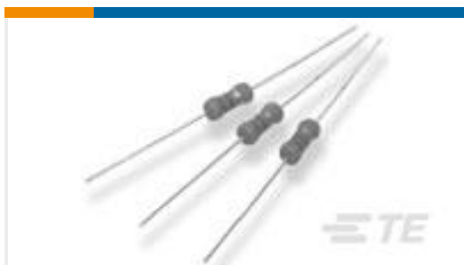
TE Part #1625879-3 FRN50 5% 1K0 (S)