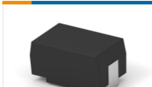
TE Part #5-2176459-3 SMD Power Resistor: 7 Watt, 0.10-500 Ohm