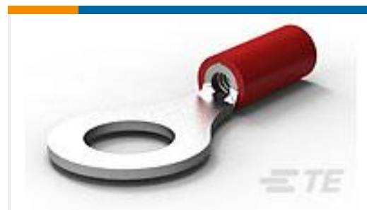
TE Part #32953 PG R 22-16 COMM 22-18 MIL 1/4