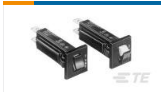
TE Part #3-1393250-0 W28-XQ1A-15=W28-