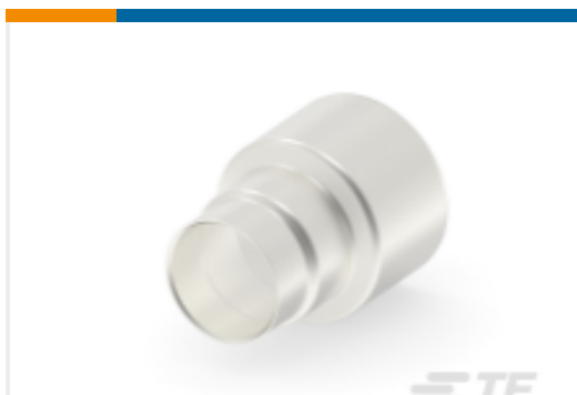
TE Part #2383853-6 H&S 35mm, Shield Sleeve