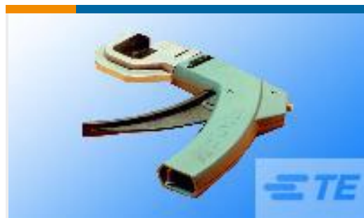
TE Part #58372-1 HEAD (IDC) 2MM C.T. W/O TL