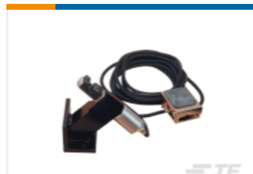
TE Part #58338-1 MTA 50/100/156 PNEUMATIC BENCH MOUNT