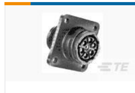
TE Part #211398-3 CPC RECPT. SIZE 13-7