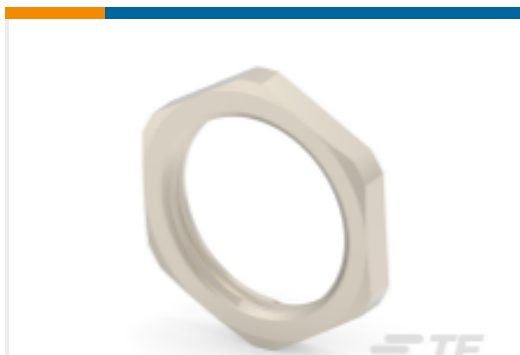
TE Part #1SNG608004R0000 EM-LN-M25-MET-A