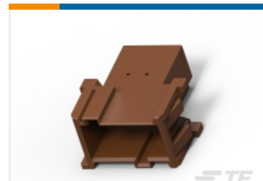
TE Part #1-965641-2 TAB HOUSING 2,8 6P