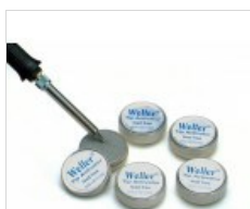
TIP TINNER LEAD FREE 0.8 OZ