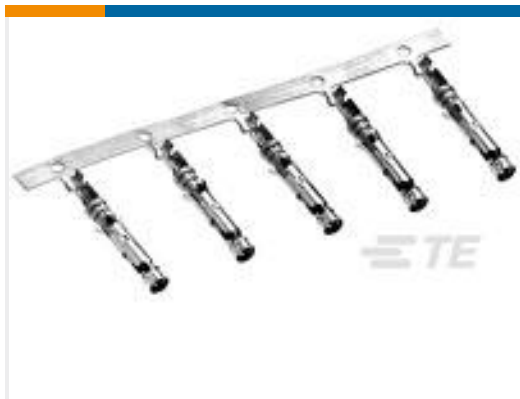
TE Part #66100-9 III+ SKT,18-16,30AU/FL,STRIP