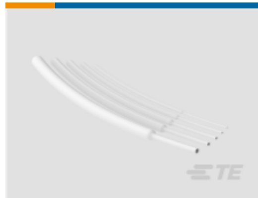
TE Part #5053332035 RNF-100-2 Heat Shrink Tubing