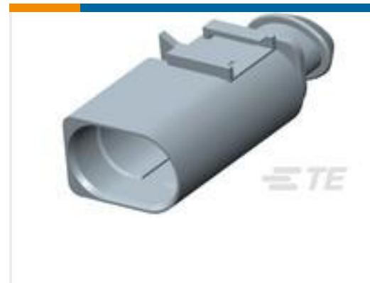
TE Part #1-1703543-0 2POS,TAB 2.8X0.8,TAB HSG,ASSY