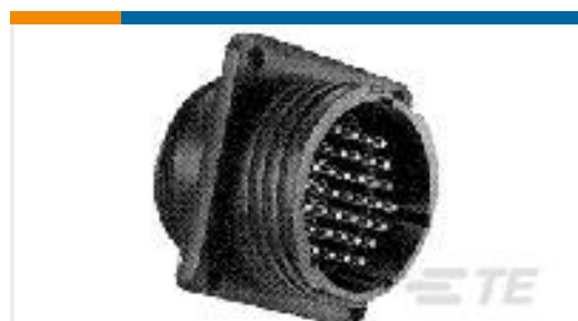
TE Part #206036-1 RECEPT,SZ 17-16 CPC