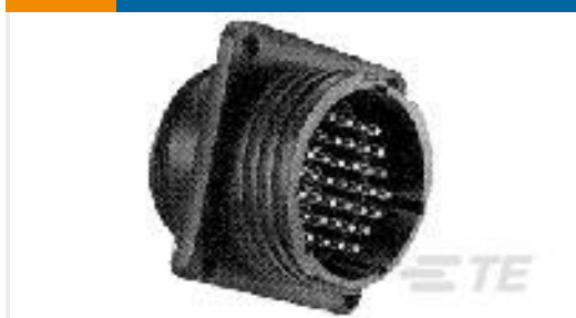
TE Part #206705-1 CPC RECP. ASY SIZE 13-9