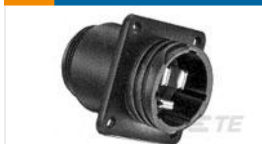
TE Part #206036-2 CPC RECEPTACLE SIZE 17-3