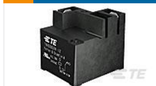
TE Part #1-1393210-3 T9AS1D12-12