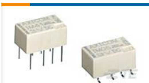
TE Part #1-1462037-4 IM03GR=IM RELAY 140mW 5V