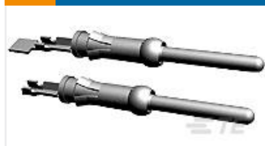
TE Part #1-66099-5 III+ PIN,18-16,TIN ,LP