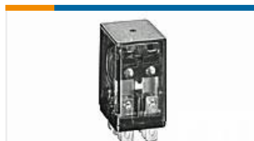
TE Part #5-1393144-5 K10P-11D15-12=K10/K20