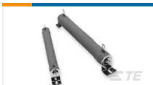
TE Part #1-1879447-3 TE 200W 10R 5% Bracket