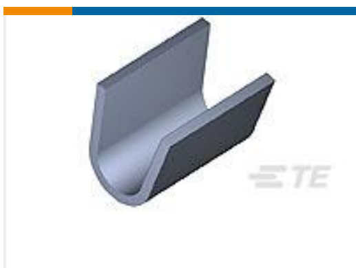
TE Part #61769-1 SPLICE 1200-2600 .020 BR