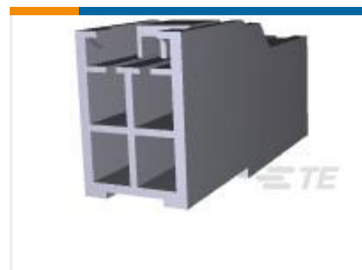
TE Part #176284-9 AMP UNIVERSAL POWER CAP 4P