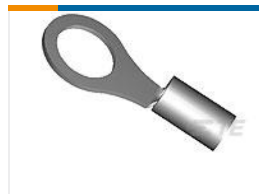
TE Part #31091 BODY R 22-16 COMM 22-18 MIL 6