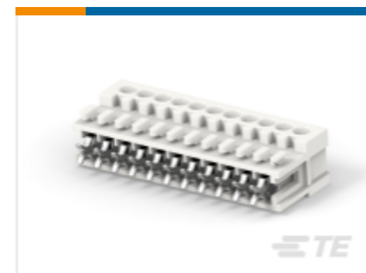
TE Part #1-2232893-1 11P MONOPLUG 2.5