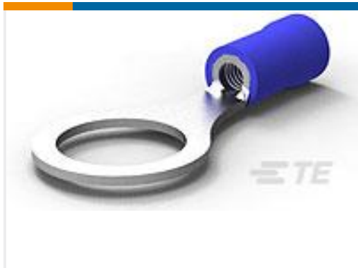
TE Part #2-34164-2 TERMINAL,PG R 16-14 3/8