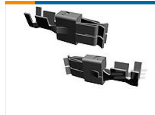
TE Part #964204-1 STD-POW-TIM KONTAKT