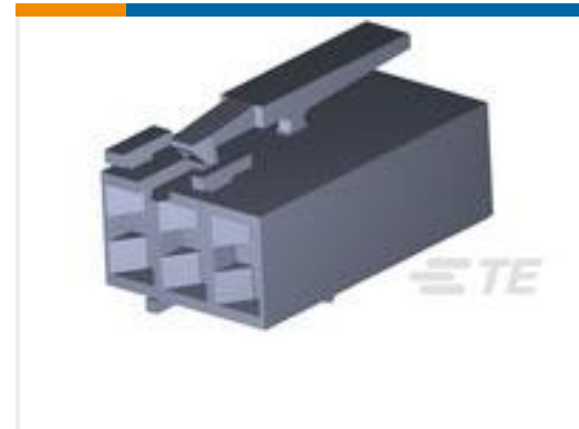
TE Part #2-1241961-7 STD TIM HOUSING MKII 3POS