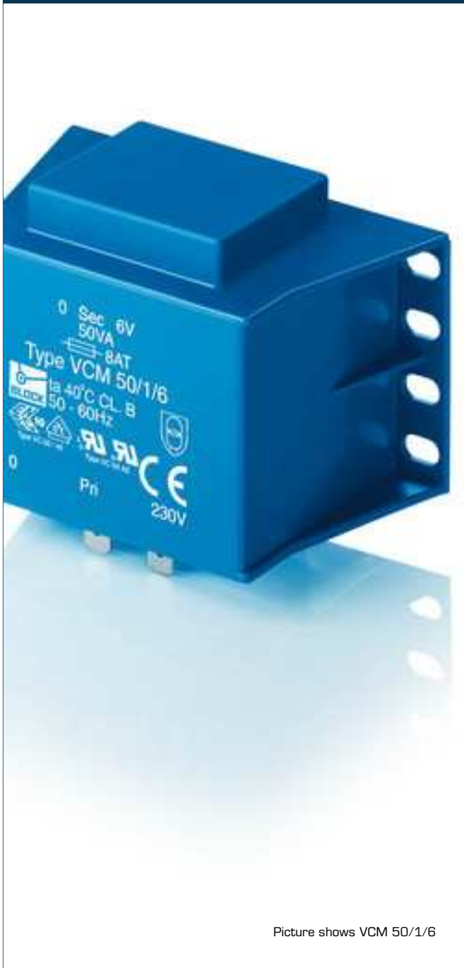
Picture shows VCM 50/1/6